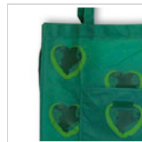
Goody Green Bag