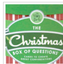
Christmas and Hanukkah Box of Questions