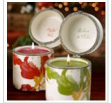
Holiday Vintage Ceramics